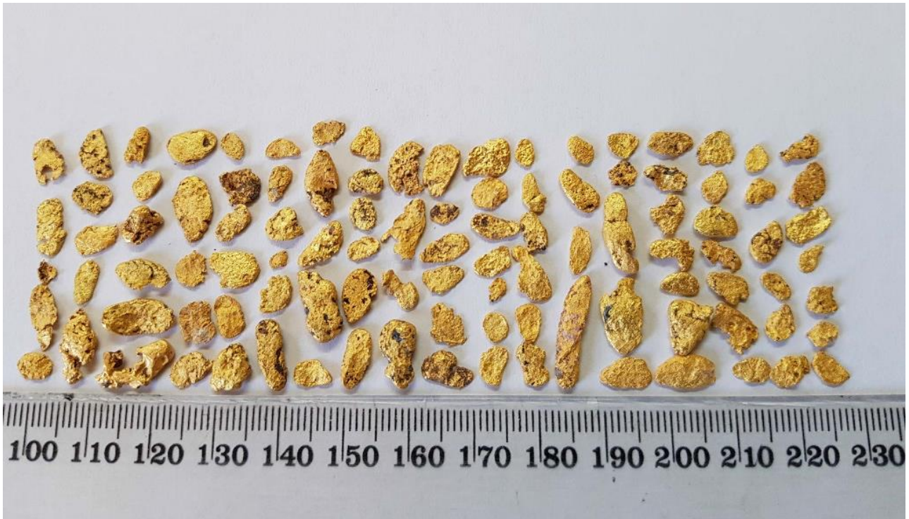
Nuggets collected from area C2 – Conglomerates to the South West of the Comet Mine, total weight of nuggets 33.167g.