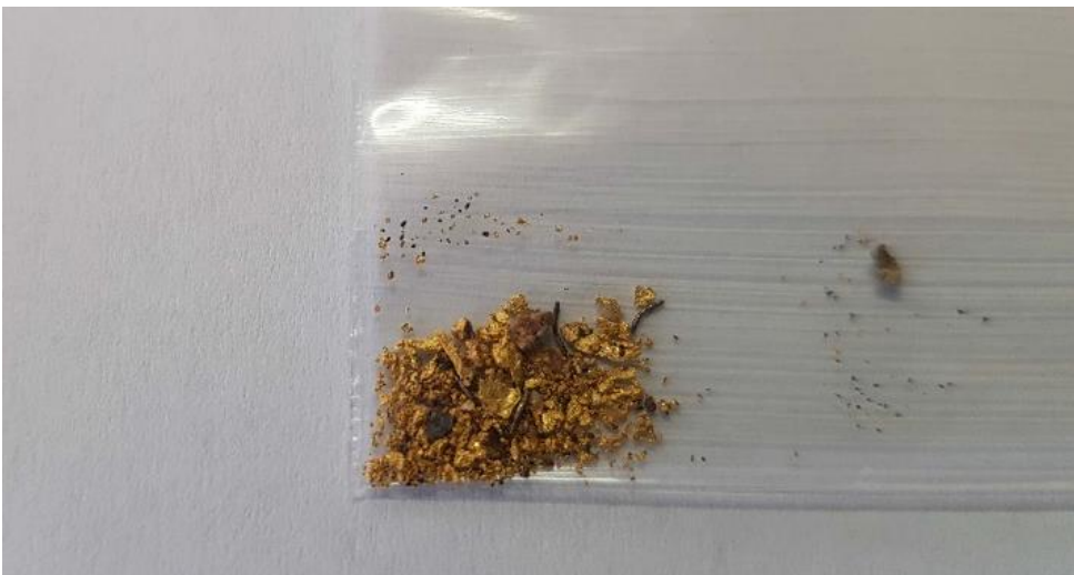
Fine gold collected in area C2 – Conglomerates to the South West of the Comet Mine, total sample weight 0.183g.

The nuggets and some gold fines had been recovered over the previous 2 days at a shallow depth using a hammer and/or pick – not a bulldozer or other earth removing equipment. This area had previously been explored by both the Stubbs Family (previous owners of the Comet Mine, see SH&MT Stubbs 1992/93 & 1993/94 Exploration Reports: WAMEX, Mines Department Index, M8113–A39484 & 42569) and BHP Minerals on behalf of Haoma. Both reported only a small number of nuggets without finding "a gold bearing conglomerate" .